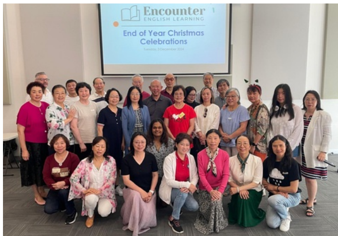
Encounter English End-of-Year Christmas Celebration