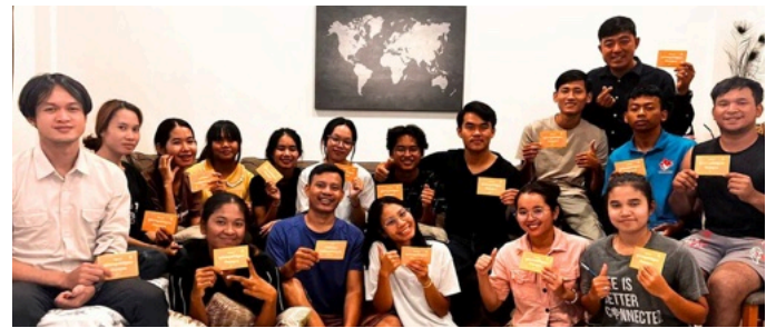
Evangelism training for uni students at a Christian dormitory

Furthermore, around 6,300 people mainly in rural villages heard the gospel presented using The Four or The Four Spiritual Laws gospel tracts with 933 praying to receive Christ. This year, there were 165 follow up groups of seekers and new believers eager to learn more about Jesus. Praise God!