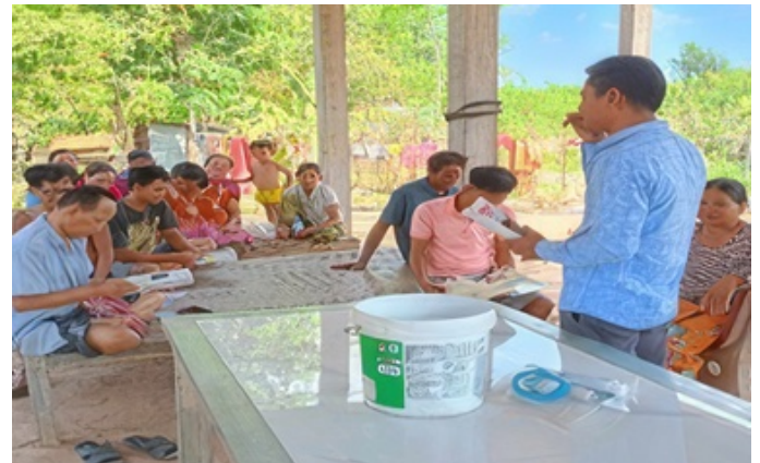
Church planting water filter project