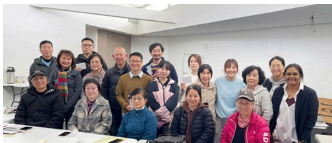
Monash University Master of TESOL students

For over a decade, ENCOUNTER ENGLISH LEARNING has empowered newcomers to Australia by equipping them with essential English skills, fostering meaningful connections, and helping them settle into their new community. Classes also explore Australian culture, customs, and practical life skills and include some Christian teaching. This year, we welcomed 40 students from diverse countries, including China, Egypt, Russia, and Japan. Praise God that 8 to 10 of these students have committed to staying weekly to study the Bible together!