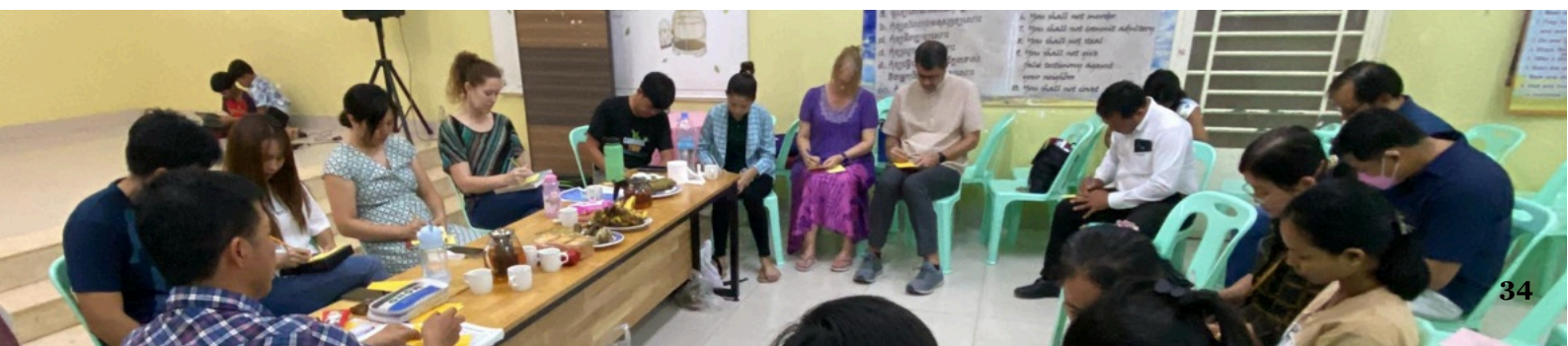
FamilyLife bible study group