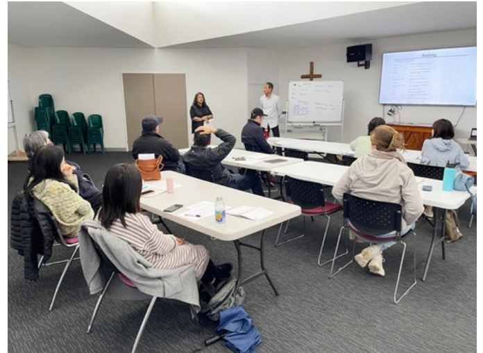
Toyota employees volunteering their time to teach English in our Encounter English class

"This was my first time participating in a church event, and it provided me with a valuable opportunity to broaden my understanding of the culture. The event was interesting, allowing me to see how the community comes together to share their vision and offer support through prayer."