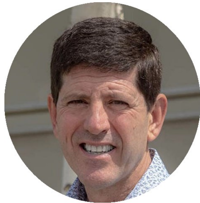
LOCAL / CRISIS CARE