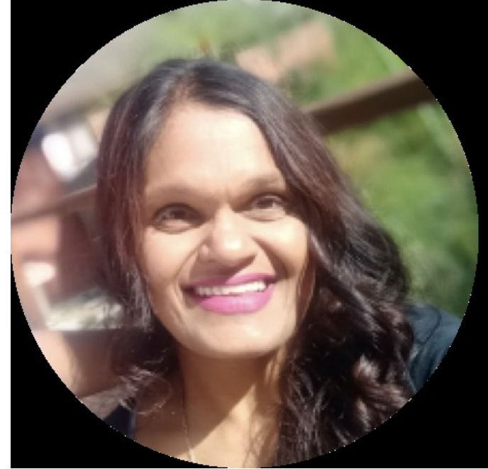
GATHERINGS / LOCAL / CARE DIRECTOR