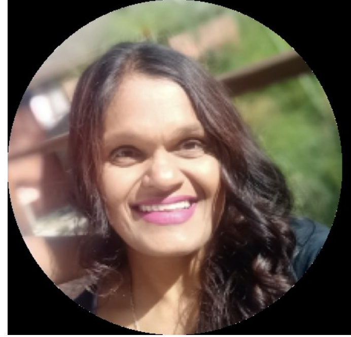
GATHERINGS / LOCAL / CARE DIRECTOR